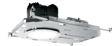
V6DR | 6" Vandal-Resistant Downlight – Round

Featuring 2,300 lumens, 80 CRI, 3500K CCT, diffuse polycarbonate lens with white finish, wide distribution, 1/2" flange