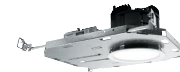
6DR | 6" Downlight – Round

Featuring 3,000 lumens, 90 CRI, 3500K CCT, regressed lens with clear semi-specular finish, medium distribution, 1/2" flange