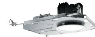
HM6DR | 6" Cleanroom Medical Downlight – Round

Featuring 2'x4', 22,000 lumens, 90 CRI, 4000K CCT, frosted acrylic pattern lens