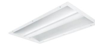
MCTA | Architectural Clean Room Troffer

Featuring 2'x4', 5,900 lumens, 80 CRI, 3500K CCT, straight diffuse acrylic insert with polycarbonate underlay