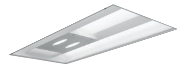
AMD | Architectural Multi-Function Medical

Featuring 2'x4', 22,000 lumens, 80 CRI, 3500K CCT, frosted acrylic pattern lens