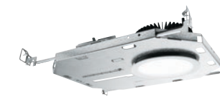
6PR | 6" Shallow Plenum Downlight – Round

Featuring 2'x4', 5,500 lumens, 80 CRI, 3500K CCT, diffuse matte acrylic center