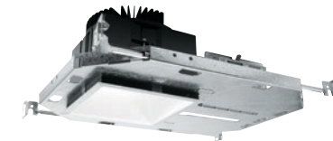
6DS | 6" Downlight – Square Featuring 2,000 lumens, 80 CRI, 4000K CCT, open reflector with clear specular finish, wide distribution, 1/2" flange