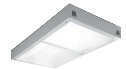
MDB | Multi-Function Bed Light

Featuring 2,000 lumens, 80 CRI, 3500K CCT, flush lens with clear semi-specular finish, medium distribution