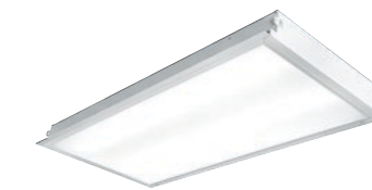
MDS | Medical/Surgical Troffer – Wide Grid

Featuring 2'x4', 22,000 lumens, 80 CRI, 3500K CCT, frosted acrylic pattern lens