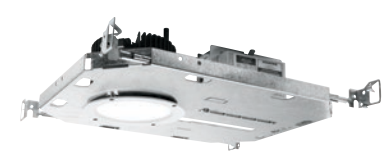
V4DR | 4.5" Vandal-Resistant Downlight – Round

Featuring 2,300 lumens, 80 CRI, 3500K CCT, diffuse polycarbonate lens with white finish, wide distribution, 1/2" flange