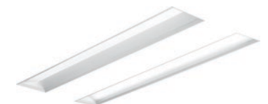
MD4 | Dual Function Bed Light

Featuring 3,000 lumens, 90 CRI, 3500K CCT, regressed lens with clear semi-specular finish, medium distribution, 1/2" flange