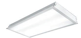
MDS | Medical/Surgical Troffer – Wide Grid

Featuring 2,700 lumens, 80 CRI, 3500K CCT, frosted acrylic lens