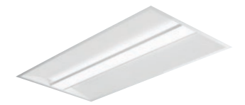
AT3 | Architectural Troffer – Straight Floating Center

Featuring 2'x4', 5,900 lumens, 80 CRI, 3500K CCT, straight diffuse acrylic insert with polycarbonate underlay