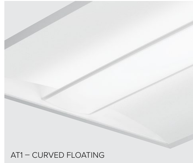
AT1 – CURVED FLOATING