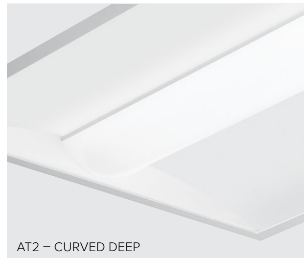
AT2 – CURVED DEEP