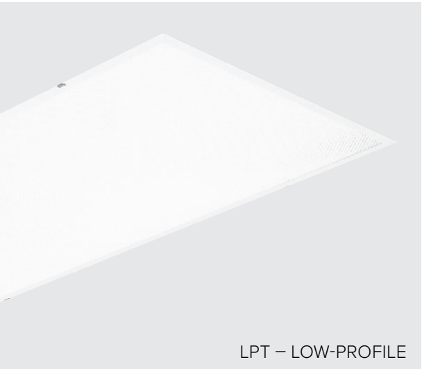
LPT – LOW-PROFILE