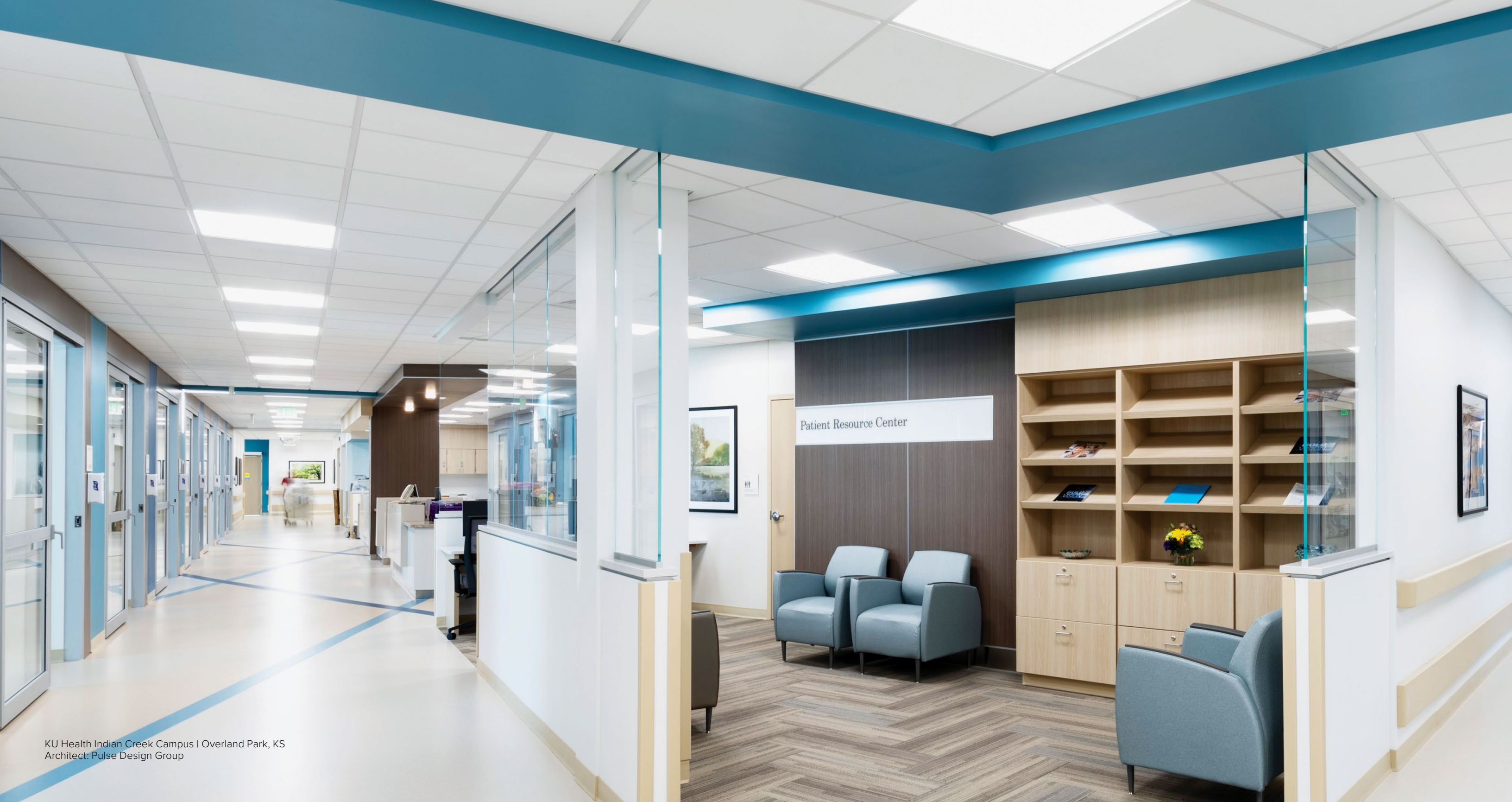
KU Health Indian Creek Campus | Overland Park, KS Architect: Pulse Design Group

The recessed SQR provides soft, smooth illumination in three perfectly square sizes. Combine 2', 3' and 4' fixtures in your space to create a unique, modern ceiling. Complement the RND family with the large-format design of the SQR.