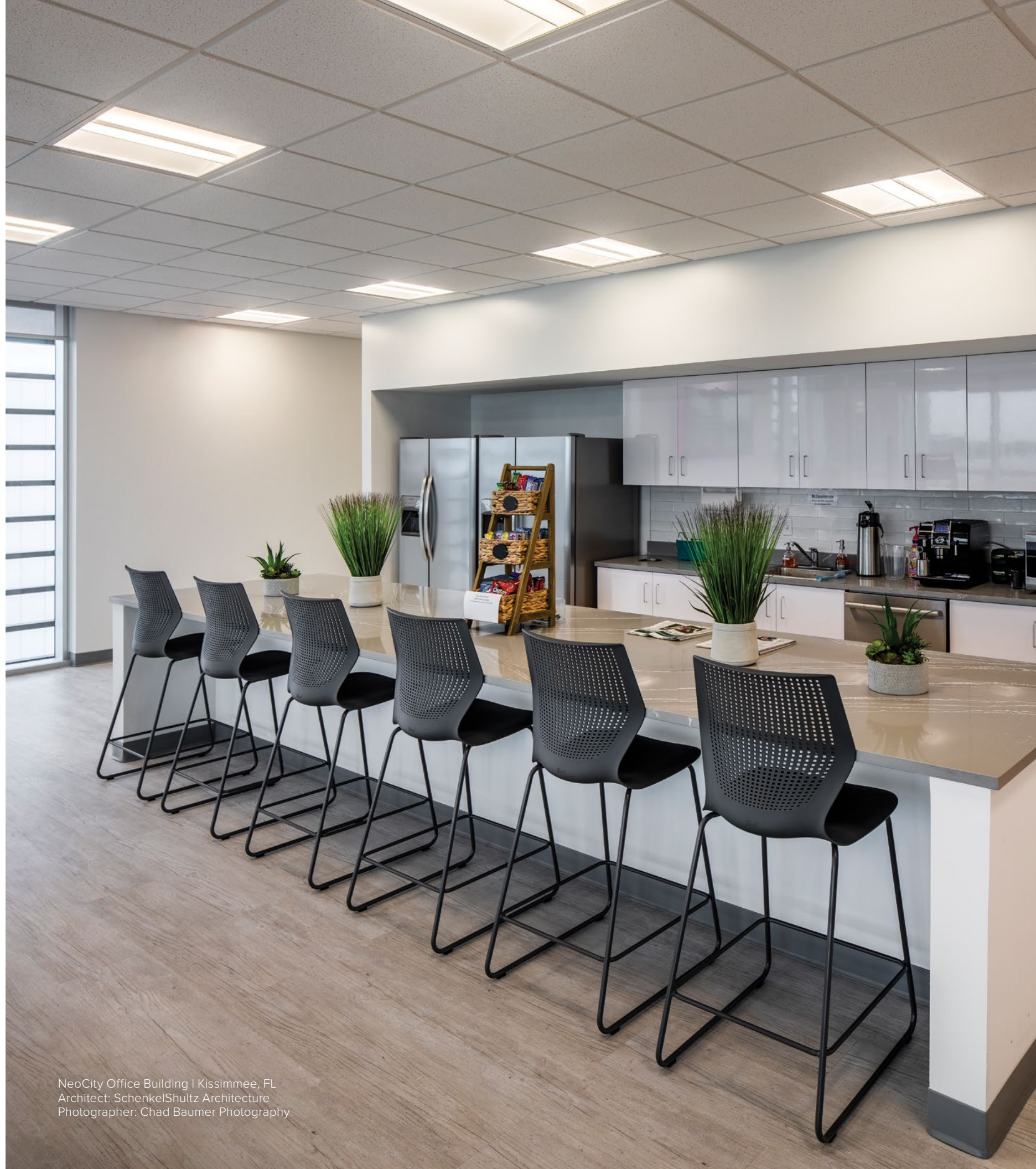
NeoCity Office Building | Kissimmee, FL Architect: SchenkelShultz Architecture

Available in 1x4, 2x2 and 2x4 sizes, the AT is ideal for offices, schools, and healthcare applications.