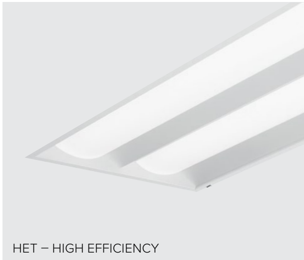
HET – HIGH EFFICIENCY