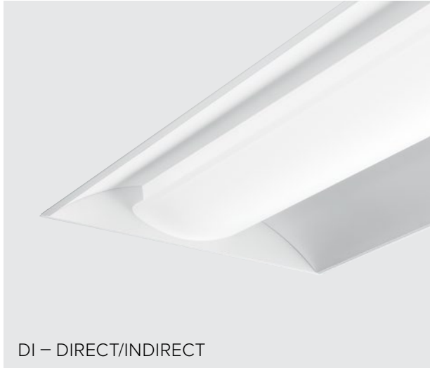
DI – DIRECT/INDIRECT

Net Conversion | Orlando, FL Architect: Forum Architecture & Interior Design