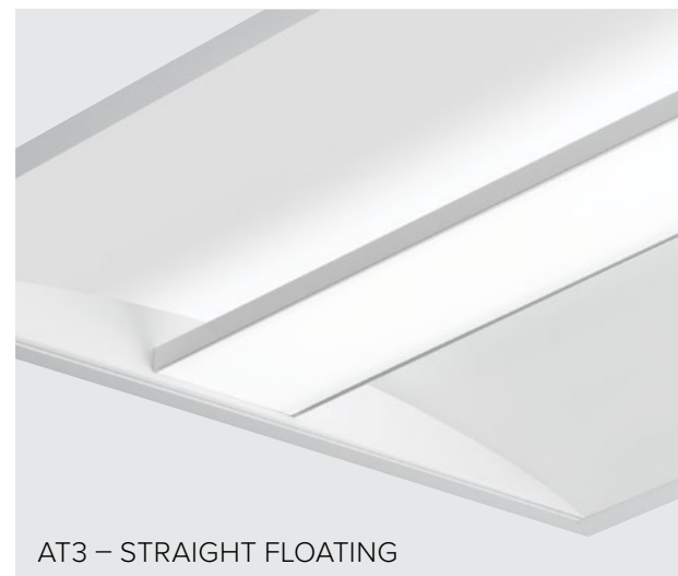
AT3 – STRAIGHT FLOATING