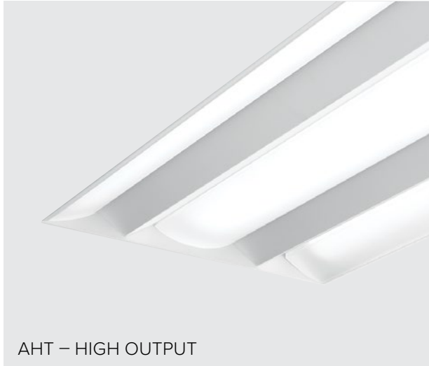
AHT – HIGH OUTPUT