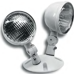
DIMENSIONS: 9-1/4" x 7-1/4"