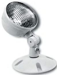
DIMENSIONS: 4-1/2" x 6-7/8"