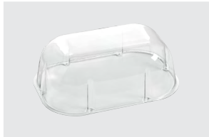
DIMENSIONS: 15" x 22" x 7-3/4"