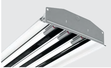
Shown with lamps, not included