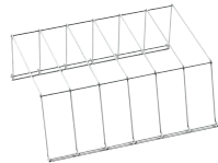
DIMENSIONS: 13-3/4" x 15-1/4" x 6"