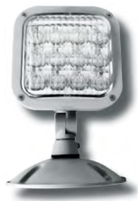
DIMENSIONS: 4-1/2" x 6-5/8"