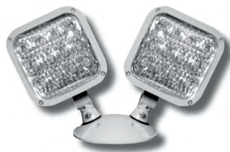
DIMENSIONS: 10-3/8" x 6-3/4"