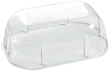
DIMENSIONS: 15" x 22" x 7-3/4"