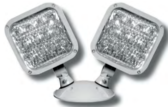
DIMENSIONS: 10-3/8" x 6-3/4"